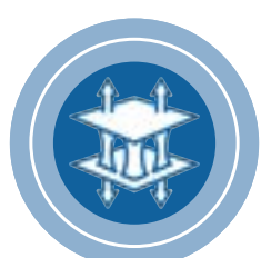
ADHESIVE & SEALANTS