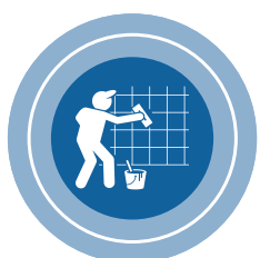
GROUTS & GROUTING COMPOUNDS