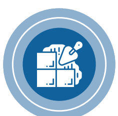
TILE & STONE FIXING SOLUTIONS